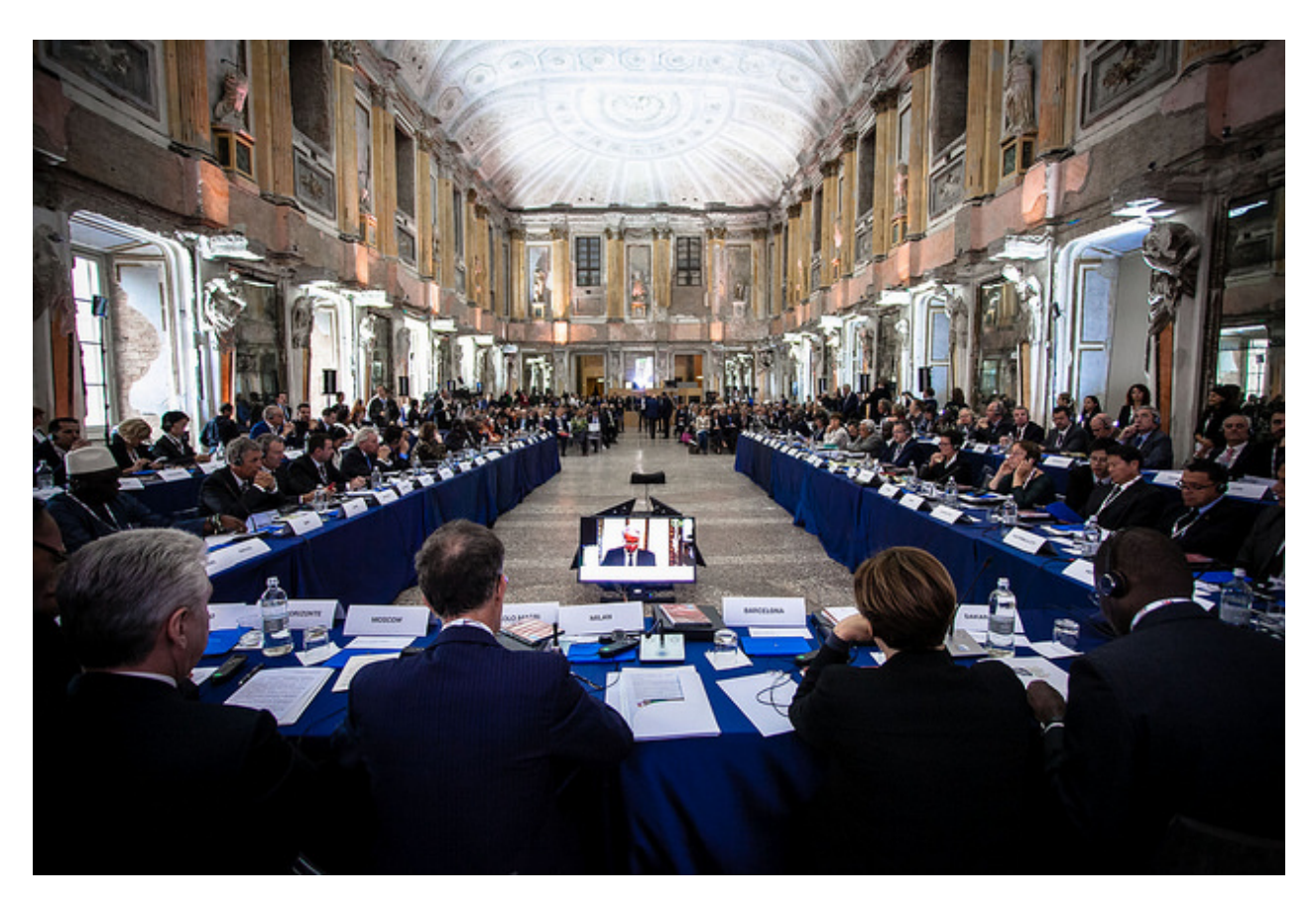
15 Ottobre, Sala delle Cariatidi -Milano